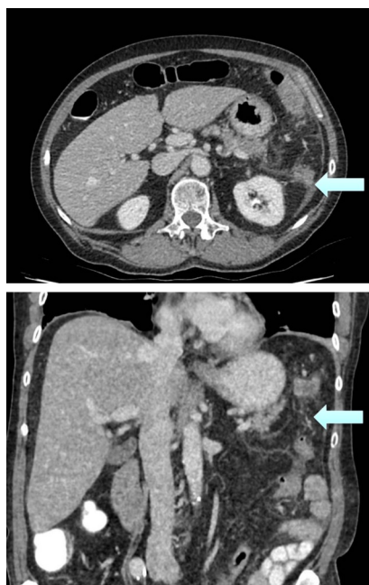
Fig 2 Computed tomographs of the abdomen (in axial and coronal views) showing fat stranding (increased density of fat, a sign of inflammatory process) and thickening (arrows) around the splenic flexure secondary to ischaemic colitis