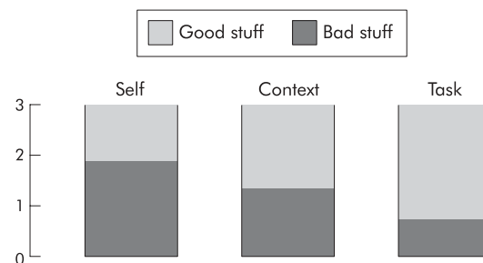
Figure 2 Three bucket model of error likelihood.